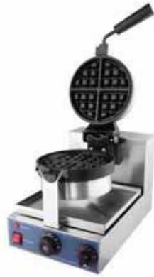
Round Rotary Waffle Maker Size: 490x250x350mm Power: 1.3Kw