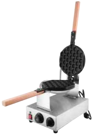
Egg Waffle Maker Size: 225x200x290mm Power: 1.2Kw