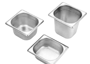
GN Pan 1/6 (176mm x 162mm) Item Size In MM # 1665 1/4 x 65MM Deep 176 x 162 x 65 # 16100 1/4 x 100MM Deep 176 x 162 x 100 # 16150 1/4 x 150MM Deep 176 x 162 x 150 # 16200 1/4 x 200MM Deep 176 x 162 x 200 # 16000 1/4 Lid 176 x 162