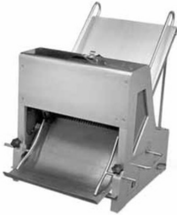
Bread Slicer Size: 730×680×900mm Power: 250W Thickness of Slice: 12mm No of Slice: 31