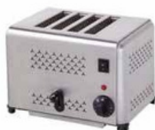
4 Slice Toaster Size: 370x210x225mm Power: 2.3Kw