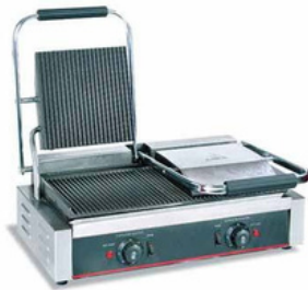
Double Contact Grill, 813 Size: 565x370x190mm Power: 1.8Kw x 2