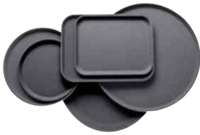
Fiber Anti Skid Tray (Black) Round Rectangular Oval 11" 12"×16" 27" 14" 14"×18" 16" 15"×20" 18" 16"×22" 18"×26"