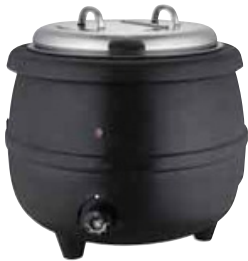
Soup Warmer (Premium) Item Capacity SWP 10 10 Ltr.