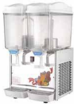
Cold Juice Dispensers Cap.: 18Ltrs. × 2 Size: 410×450×715mm Power: 300W