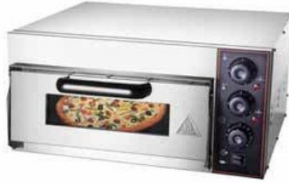
Pizza Oven Small, EP-01 Size: 560×570×280mm Stone Size: 400×400mm Power: 2Kw