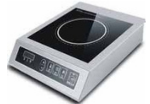
Commercial Induction Cooker Size: 415x326x110mm Power: 3500W