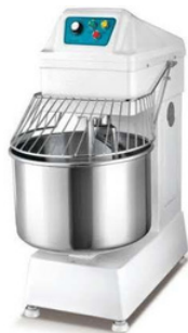
Spiral Mixers, H30 Cap.: 35 Ltrs. Power: 1.8Kw Max Kneeding: 12Kgs