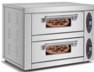
Pizza Oven Double Deck Double Tray Size: 930×630×700mm Stone Size: 483×635mm × 2 Power: 6.4Kw