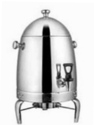
Coffee Urn W/SS Legs Item Capacity CUSS 12 12 Ltr.