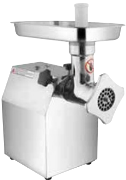
Meat Mincer, #12 Power: 850W Cap.: 120Kg/Hr.