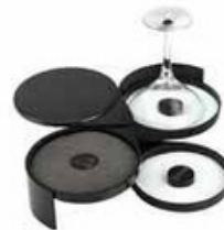
Salt & Sugar Rimmer Item - BAGR 03