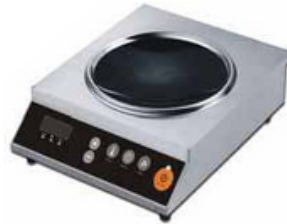
Commercial Induction Cooker, Wok Size: 415x326x110mm Power: 3500W