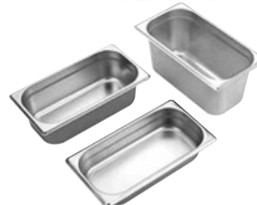
GN Pan 1/3 (325mm x 176mm) Item Size In MM # 1365 1/3 x 65MM Deep 325 x 176 x 65 # 13100 1/3 x 100MM Deep 325 x 176 x 100 # 13150 1/3 x 150MM Deep 325 x 176 x 150 # 13200 1/3 x 200MM Deep 325 x 176 x 200 # 13000 1/3 Lid 325 x 176