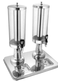
Double Juice Dispenser Item Capacity JD 33 3 Ltr. x 2