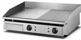
Electric Griddle, 822 Size: 730×520×235mm Power: 4.4Kw