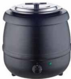
Soup Warmer (Fiber) Item Capacity SWF 10 10 Ltr.