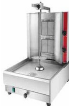
Gas shawarma 2 burner 220V Size: 400*290*500mm