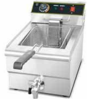
Single Fryer, 10L Size: 280x470x350mm Power: 3Kw Cap.: 10 Ltrs.