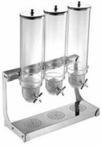
Triple Cereal Dispenser Item Capacity CD 444 4 Ltr. x 3