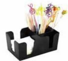
Bar Candy Item Size BABC 01 240 × 140 × 100