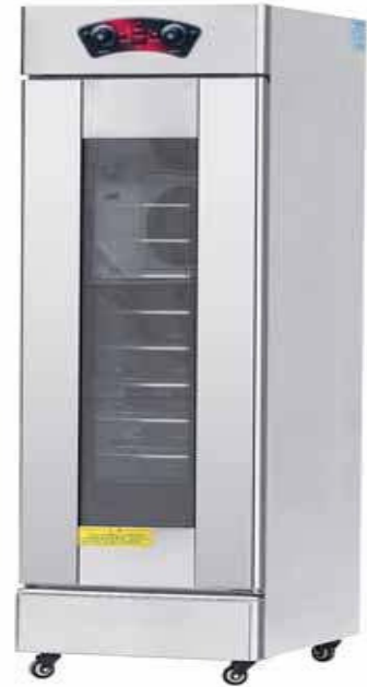
Electric Proofer, 13Tray Size: 500×690×1500mm Power: 3Kw Temp Range: 30 ~ 40° C Humidity: 80% ~ 85%