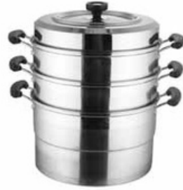
Momo Steamer 3Tier Size: 26,28,30,32&34cm