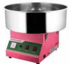
Candy Floss Machine Size: 530x530x415mm Power: 1.03Kw