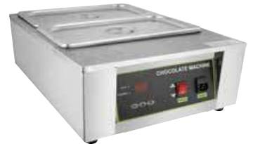
Chocolate Warmer(Digital) Power: 600W Temp Range 30 - 90 C