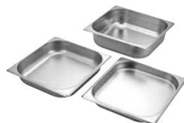
GN Pan 2/3 (354mm x 325mm) Item Size In MM # 2365 2/3 x 65MM Deep 354 x 325 x 65 # 23100 2/3 x 100MM Deep 354 x 325 x 100 # 23150 2/3 x 150MM Deep 354 x 325 x 150 # 23000 2/3 Lid 354 x 325