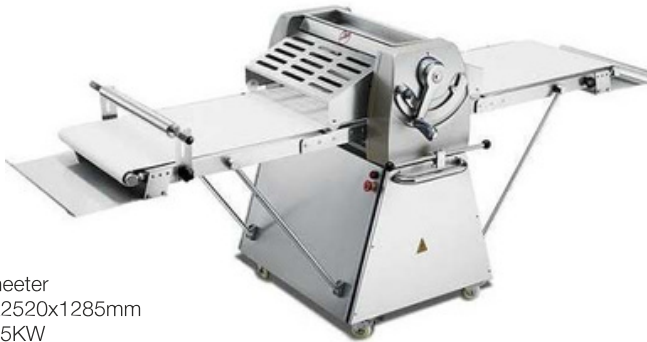
Dough Sheeter Size: 955×2520×1285mm 220V 0.75KW