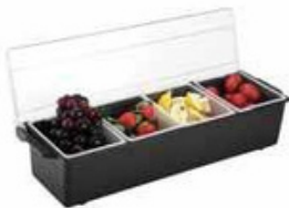
Condiment Tray 4 Compartment Item Size BACT 04 560 × 160 × 120