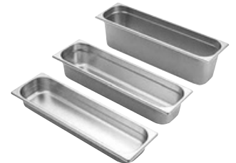
GN Pan 2/4 (530mm x 162mm) Item Size In MM # 2465 2/4 x 65MM Deep 530 x 162 x 65 # 24100 2/4 x 100MM Deep 530 x 162 x 100 # 24150 2/4 x 150MM Deep 530 x 162 x 150 # 24000 2/4 Lid 530 x 162