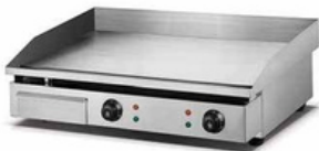
Electric Griddle, 820 Size: 730×520×235mm Power: 4.4Kw