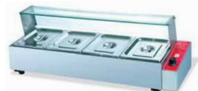
Electric Bain Marie W/ Glass & Valve (4 Pan) Size: 1200x350x360mm Power: 1.5Kw