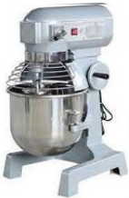
Planetary Mixers, B10 Cap.: 10Ltrs. Power: 500W Max Kneeding: 1.5kgs