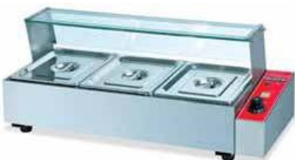
Electric Bain Marie W/ Glass & Valve (3 Pan) Size: 940x350x360mm Power: 1.5Kw