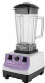
Bar Blender Cap.: 2Ltrs. Power: 1500W