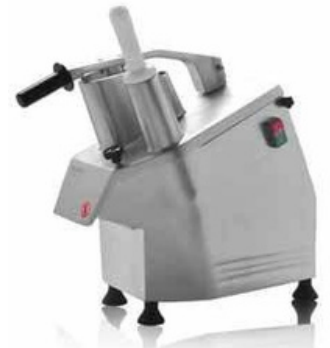
Vegetable Cutter (5 Knives) Blades Available for Dicing & French Fries