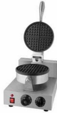
Round Waffle Maker Size: 250x350x260mm Power: 1Kw