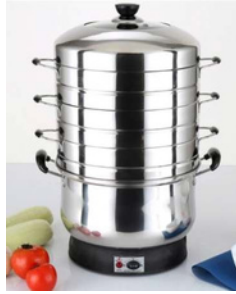
Electric Momo Steamer Dia:32cm 220V 3.4KW