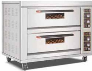
2 Deck 4 Tray, EBO 24 Dimension: 1235x800x1010mm Chamber: 860x660x200mm Power: 13.2Kw