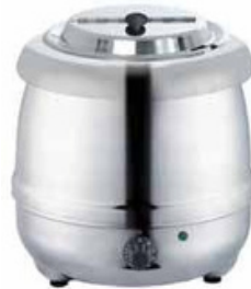
Soup Warmer (SS) Item Capacity SWSS 10 10 Ltr.