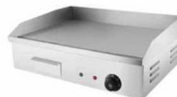
Electric Griddle, 818 Size: 550×450×235mm Power: 3Kw