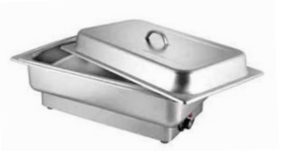
Electric SS Chafer (SS Cover) Item Capacity ESSC 10 10 Ltr.