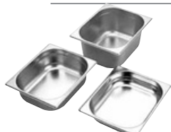
GN Pan 1/2 (325mm x 265mm) Item Size In MM # 1220 1/2 x 20MM Deep 325 x 265 x 20 # 1240 1/2 x 40MM Deep 325 x 265 x 40 # 1265 1/2 x 65MM Deep 325 x 265 x 65 # 12100 1/2 x 100MM Deep 325 x 265 x 100 # 12150 1/2 x 150MM Deep 325 x 265 x 150 # 12200 1/2 x 200MM Deep 325 x 265 x 200 # 12000 1/2 Lid 325 x 265