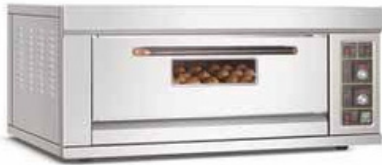
1 Deck 2 Tray, EBO12 Dimension: 1235x800x500mm Chamber: 860x660x200mm Power: 6.6Kw