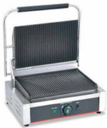
Jumbo Contact Grill, 811E Size: 425x370x190mm Power: 2.2Kw