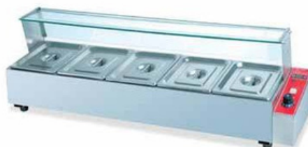
Electric Bain Marie W/ Glass & Valve (5 Pan) Size: 1450x350x360mm Power: 1.8Kw