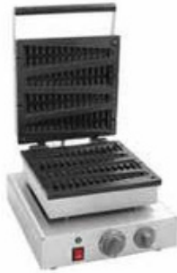
Lolly Waffle Maker Size: 450x350x280mm Power: 1.75Kw