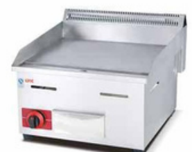
Gas Griddle, 718 Size: 550×514×540mm