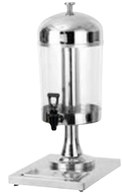
Juice Dispenser Item Capacity JD 7 7 Ltr.