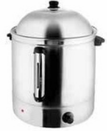
Electric Corn Steamer Size: 430x430x550mm Cap.: 48Ltrs Power: 2500W