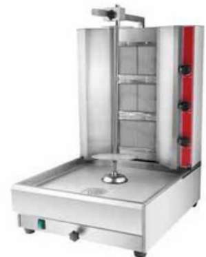
Gas shawarma 3 burner 220V Size: 580*630*800mm