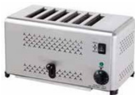
6 Slice Toaster Size: 460x210x225mm Power: 3.3Kw