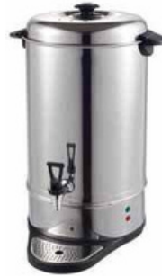
Electric Water Boiler Item Capacity EWB 20 20 Ltr.