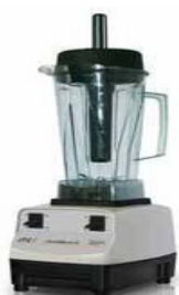
TM - 788 Power: 3HP Cap.: 2Ltrs.