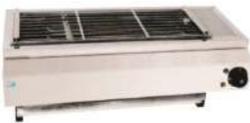
Electric Smokeless Barbecue Size: 660×350×210mm 220V 3KW