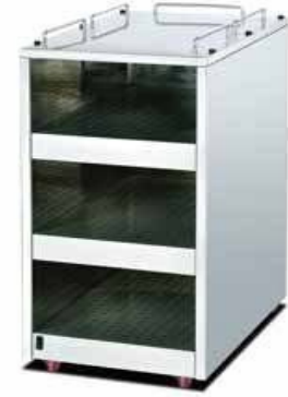
Cup Warmer Cart Size: 340×550×860mm Power: 1.5KW