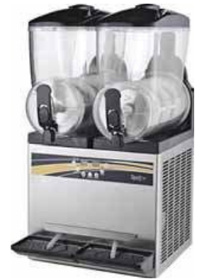
Slush Machine Cap.: 12.5Ltrs. × 2 Size: 430×530×800mm Power: 890W