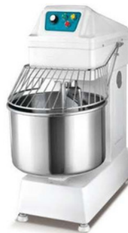
Spiral Mixers, H50 Cap.: 54 Ltrs. Power: 2.2Kw Max Kneeding: 22Kgs