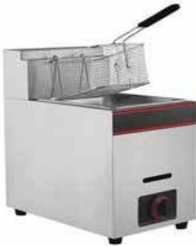
Single Gas Fryer, 71 Size: 290x520x480mm Cap.: 6 Ltrs.