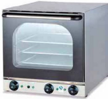
Convection Oven Size: 595×530×570mm Power: 2.6Kw