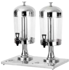
Double Juice Dispenser Item Capacity JD 77 7 Ltr. x 2