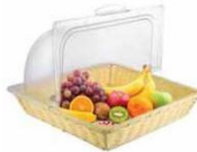
Square Poly Rattan Basket with PC Roll Cover Size: 350×330×260mm