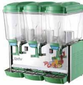
Cold Juice Dispensers Cap.: 18Ltrs. × 3 Size: 610×465×715mm Power: 350W