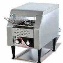
Conveyor Toaster, TT-150 Size: 290x420x390mm Power: 1.32Kw