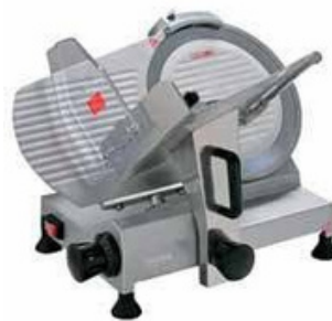
Meat Slicer (250mm) Size: 575×465×415mm Power: 150w Thickness: 0.2 - 12mm, Wider 180mm