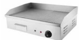
Electric Griddle, 818B Size: 550×450×235mm Power: 3Kw