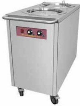
Double Plate Warmer, 100 Plates Size: 500×900×950mm Power: 800W