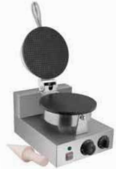
Round Cone Maker Size: 280x380x230mm Power: 1Kw