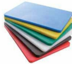
Chopping Board (18"×12") Thickness 21 & 50 mm White, Red, Green, Yellow, Blue & Brown