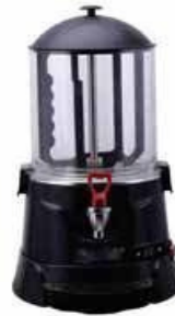
Hot Chocolate Machine Size: 420x320x600mm Power: 600W Cap: 10Ltr.