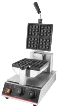
Square Rotary Waffle Maker Size: 430x260x290mm Power: 1.28Kw