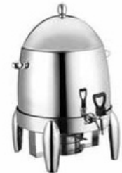
Coffee Urn W/CL Legs Item Capacity CUCL 12 12 Ltr.