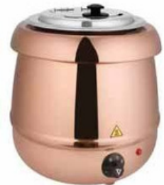
Soup Warmer (Rose Gold) Item Capacity SWRG 10 10 Ltr.