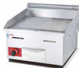
Gas Griddle, 718B Size: 550×514×540mm