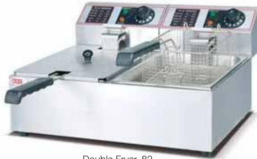
Double Fryer, 82 Size: 580x460x310mm Power: 2.5Kw x 2 Cap.: 5.5 Ltrs. x 2