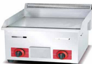
Gas Griddle, 720 Size: 730×565×540mm