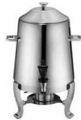
Coffee Urn W/GP Legs Item Capacity CUCP 12 12 Ltr.