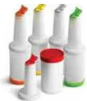
Store & Pourer 1 Ltrs. Item - BASP 01