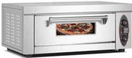
Pizza Oven Single Deck Single Tray Size: 930×630×400mm Stone Size: 483×635mm Power: 3.2Kw