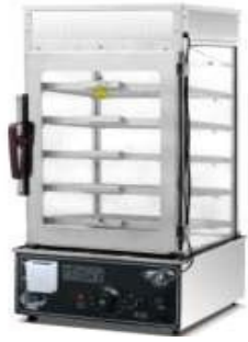
Dimsum Steamer Size: 380x400x745mm Power: 0.9Kw (900W)