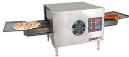
18" GAS Conveyor Pizza Oven Chain Size: 530*1470mm Temperature: 0~400°C GAS Type: LPG/LNG Dimension: 1570*800*380mm 220V 100W