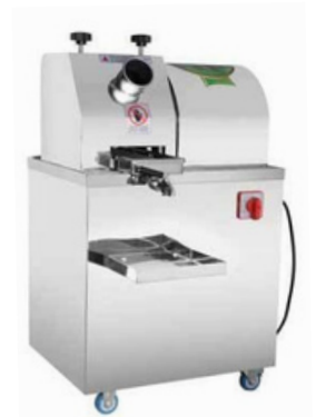
Sugar Cane Juicer Size: 480x390x780mm Power: 1.1Kw