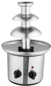
Chocolate Fountain, 3Tier Size: 240x560mm Power: 80W