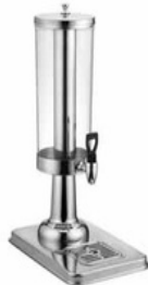
Cereal Dispenser Item Capacity JD 3 3 Ltr.