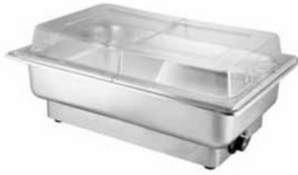
Electric SS Chafer (Flip Top Cover) Item Capacity ESSC 10 10 Ltr.