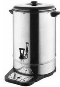
Electric Water Boiler Item Capacity EWB 30 30 Ltr.