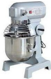
Planetary Mixers, B20 Cap.: 20Ltrs. Power: 1.1Kw Max Kneeding: 5kgs