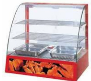
Deluxe Food Warmer Size: 660x480x630mm Power: 800W