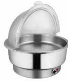
Electric Round SS Chafer (Roll Top Cover) Item Capacity ERSSC 10 10 Ltr.