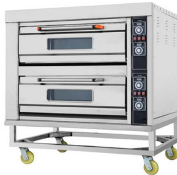
2 Deck 4 Tray, GBO 24 Dimension: 1300x890x1410mm Chamber: 870x650x230mm Tray Size: 400x600x30mm Power: 0.20Kw