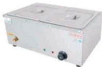
Electric Bain Marie (2 Pan) Size: 570x370x280mm Power: 1.2Kw