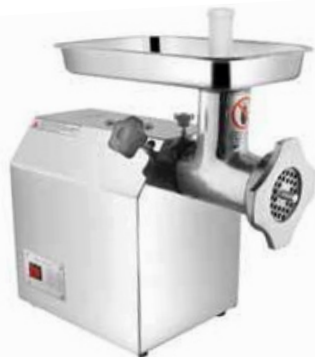
Meat Mincer, #22 Power: 1.1Kw Cap.: 150Kg/Hr.