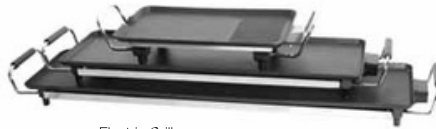
Electric Grill Item Size EGL 01 46 x 26 cm EGL 02 70 x 23 cm EGL 03 90 x 23 cm