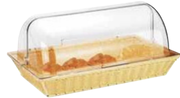
Rectangular Poly Rattan Basket with PC Roll Cover Size: 530×330×260mm