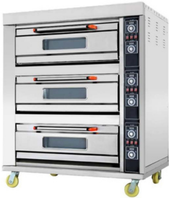
3 Deck 6 Tray, GBO 36 Dimension: 1300x840x1720mm Chamber: 870x650x230mm Tray Size: 400x600x30mm Power: 0.30Kw