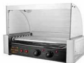
Hot Dog Grill (7 Rollers) Size: 570x320x445mm Power: 1.05Kw