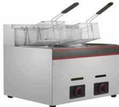
Double Gas Fryer, 72 Size: 570x520x480mm Cap.: 6 Ltrs. x 2