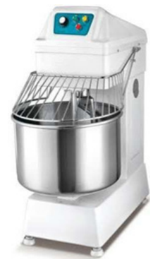
Spiral Mixers, H60 Cap.: 65 Ltrs. Power: 2.6Kw Max Kneeding: 26Kgs