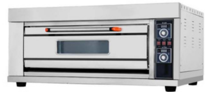
1 Deck 2 Tray, GBO12 Dimension: 1300x890x630mm Chamber: 870x650x230mm Tray Size: 400x600x30mm Power: 0.10Kw