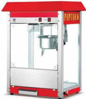
Pop Corn Machine Size: 560x420x760mm Power: 1.5Kw