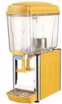
Cold Juice Dispensers Cap.: 18Ltrs. Size: 265×490×715mm Power: 300W