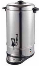
Electric Water Boiler Item Capacity EWB 16 16 Ltr.