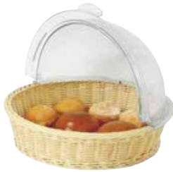
Round Poly Rattan Basket with PC Roll Cover Size: Ø 410×200mm