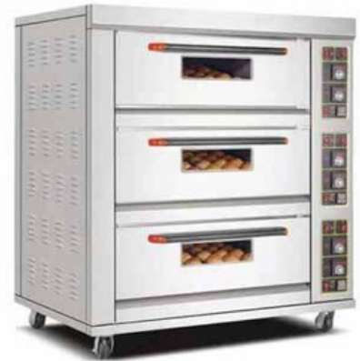
3 Deck 6 Tray, EBO 30 Dimension: 1200x820x1450mm Chamber: 860x660x220mm Power: 19.6Kw