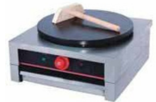
Crepe Maker Size: 520x450x220mm Power: 3Kw