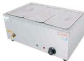
3 Pans Electric Bain Marie Size: 575x365x265mm 220V 1.5KW