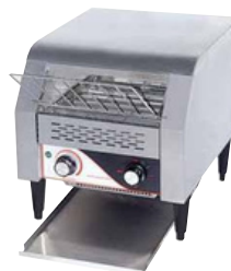
Conveyor Toaster, TT-300 Size: 370x420x390mm Power: 1.92Kw