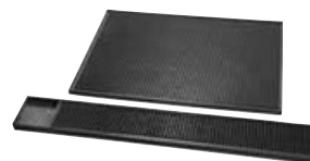
Bar Matt Item Size BABM 01 580 × 180 × 10 Service Matt Item Size BASM 01 460 × 310 × 10