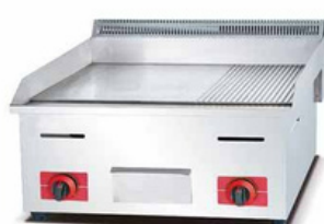
Gas Griddle, 722 Size: 730×565×540mm