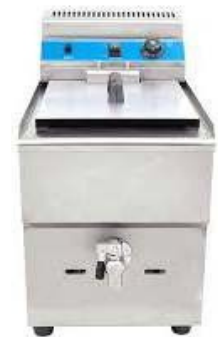
Gas Fryer Single, 17L Size: 640x310x760mm Cap.: 17 Ltrs.