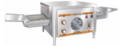
12" Electric Conveyor Pizza Oven Chain Size: 380*1000mm Temperature: 0~400°C Dimension: 1100*620*370mm 220V 6.7Kw