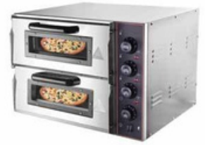
Pizza Oven Small Double, EP-02 Size: 560×570×440mm Stone Size: 400×400mm × 2 Power: 3Kw