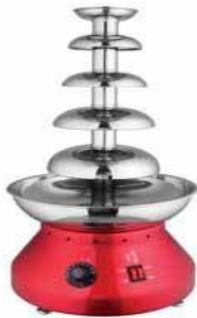
Chocolate Fountain, 5Tier Size: 330x600mm Power: 600W