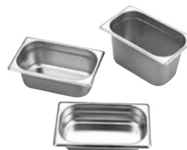
GN Pan 1/4 (265mm x 162mm) Item Size In MM # 1465 1/4 x 65MM Deep 265 x 162 x 65 # 14100 1/4 x 100MM Deep 265 x 162 x 100 # 14150 1/4 x 150MM Deep 265 x 162 x 150 # 14200 1/4 x 200MM Deep 265 x 162 x 200 # 14000 1/4 Lid 265 x 162