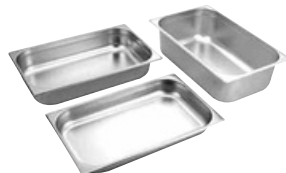
GN Pan 1/1 (530mm x 325mm) Item Size In MM # 1120 1/1 x 20MM Deep 530 x 325 x 20 # 1140 1/1 x 40MM Deep 530 x 325 x 40 # 1165 1/1 x 65MM Deep 530 x 325 x 65 # 11100 1/1 x 100MM Deep 530 x 325 x 100 # 11150 1/1 x 150MM Deep 530 x 325 x 150 # 11200 1/1 x 200MM Deep 530 x 325 x 200 # 11000 1/1 Lid 530 x 325