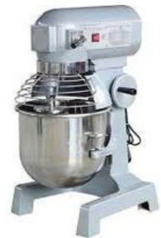
Planetary Mixers, B40 Cap.: 40Ltrs. Power: 2.2Kw Max Kneeding: 12Kgs