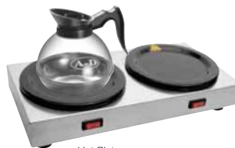
Hot Plate Size: 376x200x70mm Power: 80W x 2