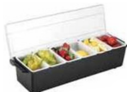
Condiment Tray 6 Compartment Item Size BACT 06 560 × 160 × 120