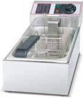
Single Fryer, 81 Size: 290x460x310mm Power: 2.5Kw Cap.: 5.5 Ltrs.