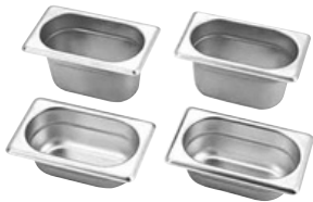
GN Pan 1/9 (176mm x 108mm) Item Size In MM # 1965 1/9 x 65MM Deep 176 x 108 x 65 # 19100 1/9 x 100MM Deep 176 x 108 x 100 # 19150 1/9 x 150MM Deep 176 x 108 x 150 # 19300 1/9 Lid 176 x 108