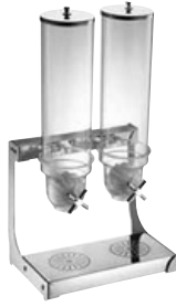
Double Cereal Dispenser Item Capacity CD 44 4 Ltr. x 2 Ltr.