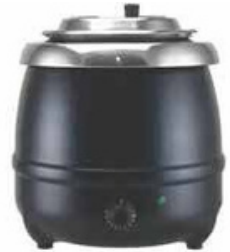
Soup Warmer (Metal) Item Capacity SWM 10 10 Ltr.