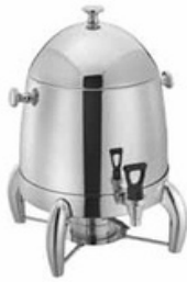
Coffee Urn W/NL Legs Item Capacity CUNL 12 12 Ltr.