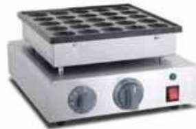
Pie Maker Size: 325x300x185mm Power: 1Kw