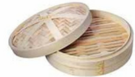
Bamboo Dim Sum Basket Size: Ø 5", 6", 7", 8", 10", 12", 14", 16", 18", 20" & 22"