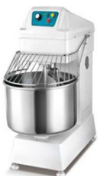
Spiral Mixers, H20 Cap.: 22 Ltrs. Power: 1.1Kw Max Kneeding: 8Kgs