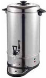
Electric Water Boiler Item Capacity EWB 10 10 Ltr.