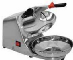
Metal Ice Crusher Size: 425x200x300mm Power: 250W