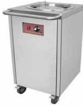
Single Plate Warmer, 50 Plates Size: 460×560×950mm Power: 400W