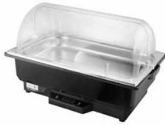
Electric Fiber Chafer (Roll Top Cover) Item Capacity EFC 10 10 Ltr.