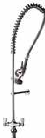
Pre-rinse Spray Unit Available in Deck / Wall Mounted