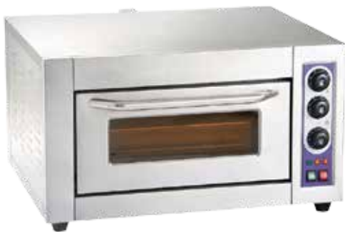
Electric Baking Oven

Dimension(mm) : 1260 x 850 x 570 Tray Size : 400 x 600mm Temp : 20 ~ 300°C Power : 6.3 kw, 220V