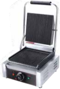
Single Deck Sandwich Griller Dimension(mm): 305 x 400 x 210 Power: 1.8 kw, 220V