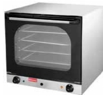
Electric Convection Oven

Dimension(mm) : 865 x 715 x 450 Power : 3.0 kw, 220V