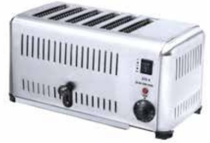
6 Slot Toaster Dimension(mm) : 460 x 210 x 225 Power : 3.3 kw, 220V