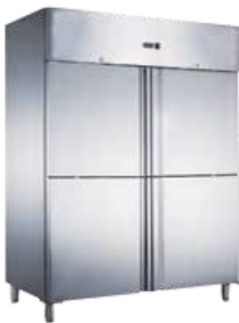
4 Door Vertical Chiller / Freezer Capacity : 1200 Ltrs. Dimension(mm) : 1340 x 810 x 2010 Temp : +2oC ~ +8oC / -22oC ~ -18oC Power : 0.41kw, 220V / 0.73kw, 220V