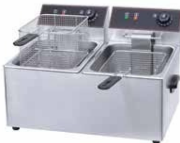
Deep Fat Fryer Double Tank (10L + 10L) Dimension(mm) : 725 x 440 x 345 Power : 3.2 + 3.2 kw, 220V Also available in 6 & 17 Ltrs.