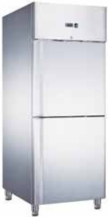
2 Door Vertical Chiller / Freezer Capacity : 600 Ltrs. Dimension(mm) : 680 x 810 x 2010 Temp : -2oC ~ 8oC / -22oC ~ -18oC Power : 0.21kw, 220V / 0.47kw, 220V