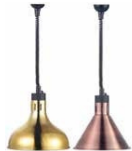
Food Warming Lamp Dia : 290 mm Power : 0.25 kw, 220V