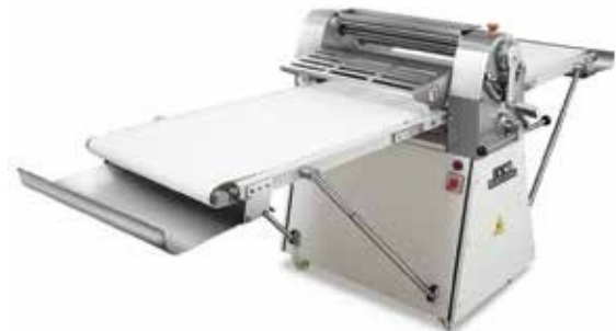
Dough Sheeter – Floor Type

Dimension(mm) : 650 x 660 x 760 Slice Qty : 31 Nos. Thickness of Slice : 12mm Power : 0.25 kw, 220V