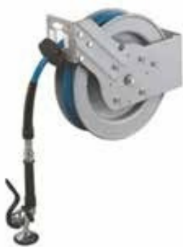
Flushing Hose Reel Available in 7.5 mtr / 15 mtr.