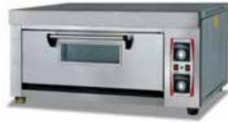
1Deck/2 Tray Baking Oven - Electric

Dimension(mm) : 1340 x 880 x 650 Tray Size : 400 x 600mm Temp : 20 ~ 350°C Power : 0.1 kw, 220V