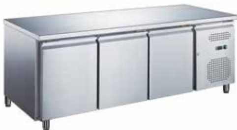
3 Door Work Top Chiller / Freezer Capacity : 417 Ltrs. Dimension(mm) : 1795 x 700 x 850 Temp : -2oC ~ +8oC / -22oC ~ -18oC Power : 0.23kw, 220V / 0.56kw, 220V