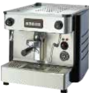
Single Group Coffee Machine Size(mm) : 430 x 540 x 455 Capacity : 6 Ltrs. Power : 1.8 kw, 220V