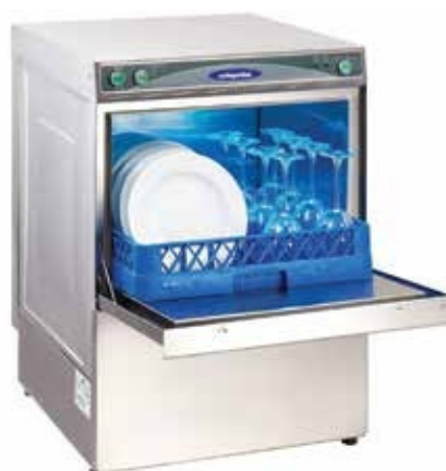
Under Counter Dish Washer Size(mm) : 595 x 655 x 830 Capacity : 560 Plate/Hr. Power : 5.5 kw, 220V Crate Size(mm) : 500 x 500