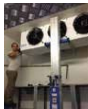
Installation of Walk in Cooler