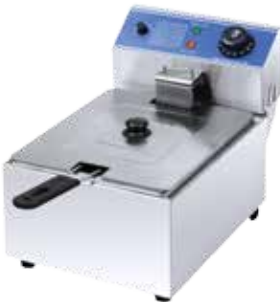
Deep Fat Fryer Single Tank (10L) Dimension(mm) : 370 x 440 x 340 Power : 3.2 kw, 220V Also available in 6 & 17 Ltrs.