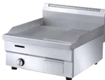
Griddle Plate - Gas ( ½ smooth+ ½ Grove) Dimension (mm) : 600 x 590 x 500 Also available in Flat Range