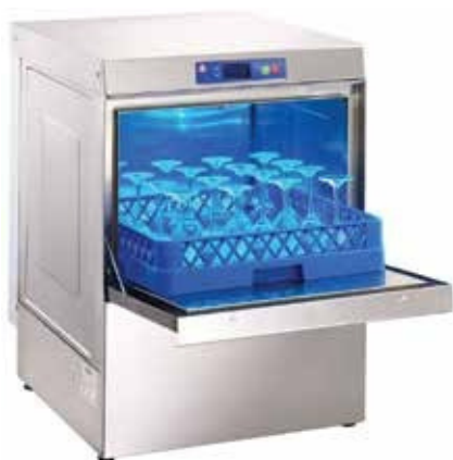
Under Counter Glass Washer Size(mm) : 420 x 450 x 620 Capacity : 500 Glass/Hr. Power : 3.3 kw, 220V Crate Size(mm) : 350 x 350