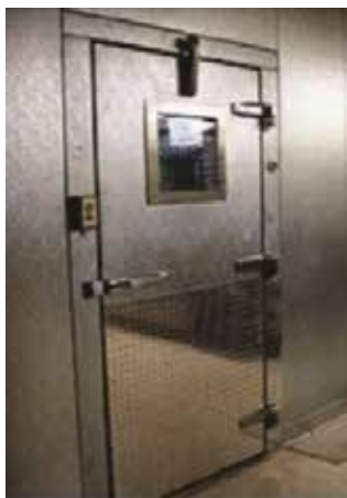
Walk in Refrigerator / Freezer (Single Room) Walk in Refrigerator / Freezer (Double Room)

Joinery is achieved through Cam locks and finished with Silicon Sealant