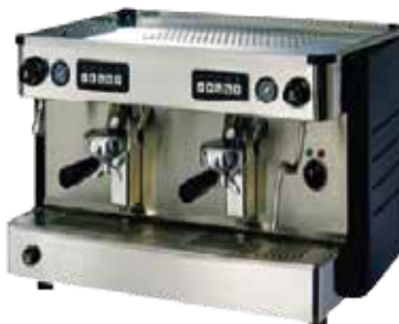
Double Group Coffee Machine Size(mm) : 750 x 540 x 455 Capacity : 10.5 Ltrs. Power : 3 kw, 220V