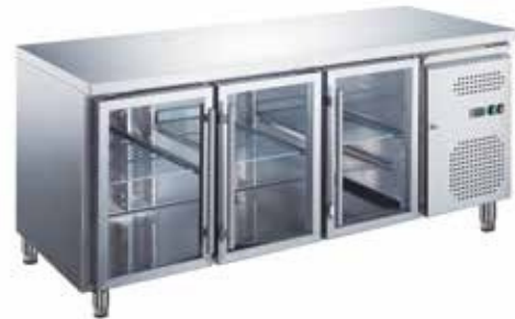
3 Glass Door Work Top Chiller Capacity : 417 Ltrs. Dimension(mm) : 1795 x 700 x 850 Temp : -2oC ~ +8oC Power : 0.23kw, 220V