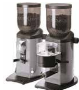
Coffee Grinder Size(mm) : 270 x 375 x 165 Capacity : 0.5 Kgs. Power : 0.14 kw, 220V