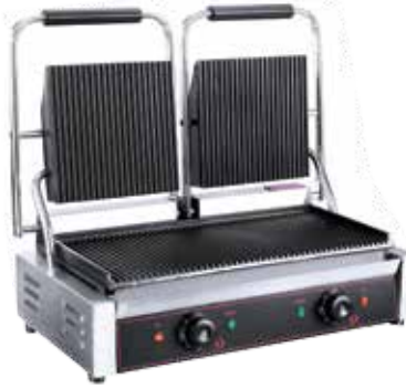
Double Deck Sandwich Griller Dimension(mm) : 580 x 410 x 210 Power : 3.6 KW, 220V