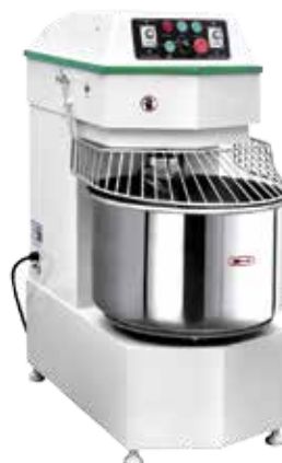
Spiral Mixer (Double Speed)

Capacity : 20 Ltrs. Raw Flour : 6 Kgs. Power : 0.75 kw, 220V Also available in 5, 10 , 30 , 40 Ltrs.