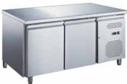
2 Door Work Top Chiller/ Freezer Capacity : 282 Ltrs. Dimension(mm) : 1360 x 700 x 850 Temp : -2oC ~ +8oC / -22oC ~ -18oC Power : 0.22kw, 220V / 0.52kw, 220V