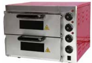
Double Deck Pizza Oven Dimension(mm) : 560 x 570 x 440 Inner Chamber (mm) : 400 x 400 x 135 Power : 3.0 kw, 220V