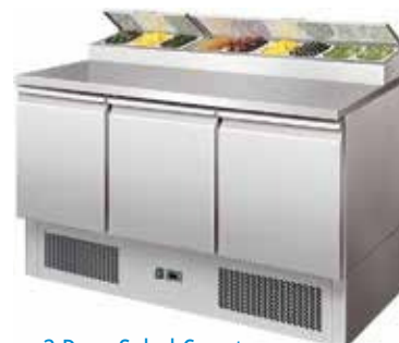
3 Door Salad Counter Capacity : 8 x 1/6 GN Pan Dimension(mm) : 1365 x 700 x 970 Temp : -2oC ~ +8oC Power : 0.30kw, 220V