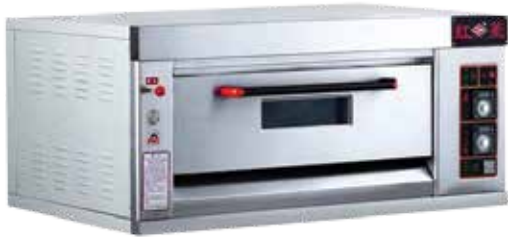
1Deck/ 2 Tray Baking Oven – Gas

Dimension(mm) : 1340 x 880 x 650 Tray Size : 400 x 600mm Temp : 20 ~ 350°C Power : 0.1 kw, 220V