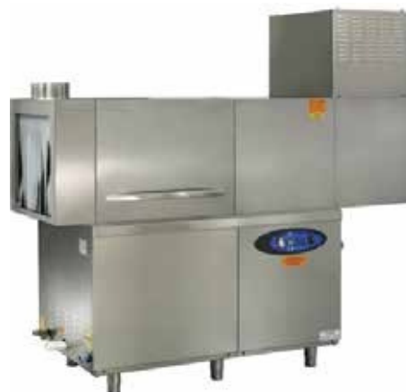
Conveyor Type Dish Washer Machine Size(mm) : 2050 x 800 x 1880 W/Dryer Capacity : 1650 Plate/Hr. Power : 47 kw, 440V Crate Size(mm) : 500 x 500 Also available without Dryer Model