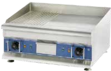
Griddle Plate – Elec. ( ½ smooth+ ½ Grove) Dimension (mm) : 600 x 520 x 310 Power : 5 kw, 220V Also available in Flat Range