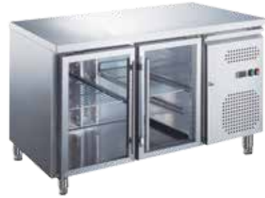
2 Glass Door Chiller Capacity : 282 Ltrs. Dimension(mm) : 1360 x 700 x 850 Temp : -2oC ~ +8oC Power : 0.22kw, 220V