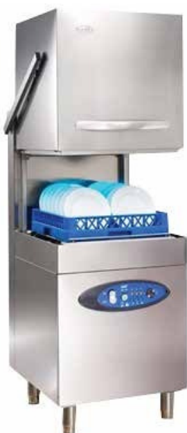
Hood Type Dish Washer Machine Size(mm) : 670 x 785 x 1420(1860) Capacity : 750 Plate/Hr. Power : 8.16 kw, 440V Crate Size(mm) : 500 x 500