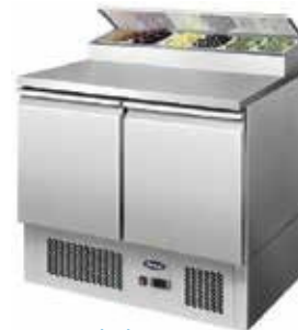
2 Door Salad Counter Capacity : 5 x 1/6 GN Pan Dimension(mm) : 900 x 700 x 970 Temp : -2oC ~ +8oC Power : 0.25kw, 220V